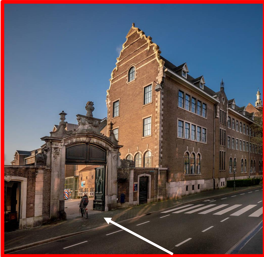
Main entrance (ancient gate)