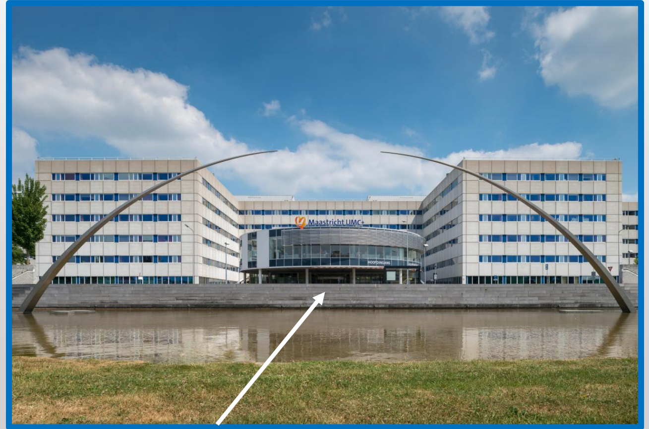
Main entrance (revolving/rotating door)